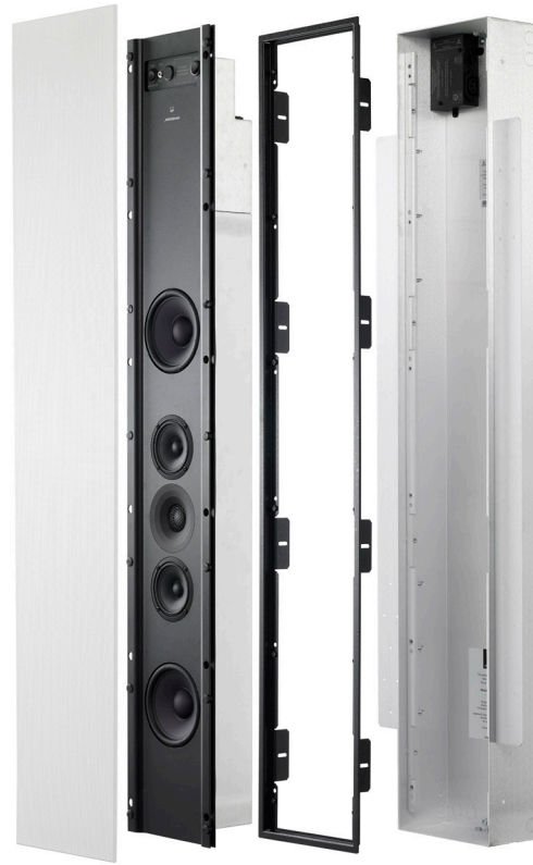
DSP750 shown with grille and RF600 rough-in box

The sealed aluminium cabinet design ensures that a reliable and repeatable performance is achieved regardless of the installation. High dynamic range, low distortion and an outstanding signal-to-noise ratio combine to provide full-range sound with exceptional headroom and low-listener fatigue in any room.