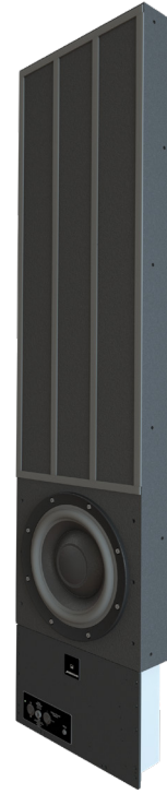
DSW600 acoustic enclosure and electronics module

The DSW600 is a shallow-depth in-wall subwoofer designed to handle the most bass-heavy music and action-movie soundtracks effortlessly. Deep, powerful and exciting bass is delivered with perfect timing down to 24Hz thanks to Meridian's unique 'DSP' advantage and Enhanced Bass Alignment Technology. The DSW600 can integrate into a variety of installation applications. It delivers impactful bass in any room size as part of any loudspeaker configuration and, when combined with any Meridian Architectural loudspeaker, the resulting two-box in-wall solution provides full-range performance suitable for either two-channel or surround-sound systems. It can also be used to play the dedicated LFE channel - either on its own or when used in multiples.